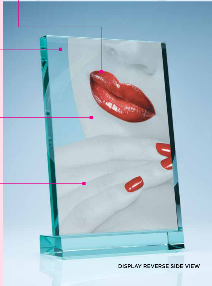
DISPLAY REVERSE SIDE VIEW