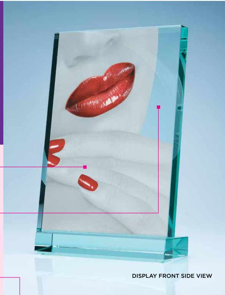
DISPLAY FRONT SIDE VIEW

HDEnhance optically clear printed polyester film outlasts and out performs all traditional vinyl graphic applications to flat glass and Plexiglas. A true testament to the quality and preeminence of HDEnhance is that it is backed by the industry's first 10-year warranty.